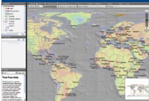
Flexible Layout Template design showing a map with capital cities, created using raster digital elevation map and vector data from SDF and Oracle.

Flexible Web Layout Templates and application widgets accelerate the development of web mapping applications created with Autodesk MapGuide Enterprise. Since design and development tasks are separated, both nonspatial web designers and application developers can quickly build rich web mapping sites. With access to a growing number of widgets and web templates, designers can focus on site aesthetics without writing much code. And developers can freely focus on building powerful interactive AJAX (asynchronous JavaScript® and XML) applications.